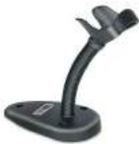
STD-QD20-BK: Hands-free Stand Allows use of the reader in hands-free mode. Also available in white.