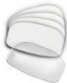
11-0318: Replacement Window 5 pack Allows the user to replace a damaged window without sending the scanner in for repairs.