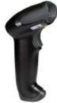
Fig. 1: Voyager 1250g Scanner

Voyager 1250g provides superior scan performance and extended depth of field, which combine to deliver an ergonomic solution for scan-intensive applications.